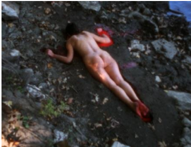
Ana Mendieta, Still from Silueta Sangrienta , 1975.