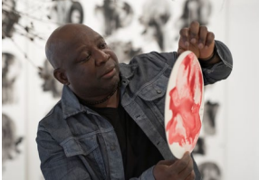
Barthélémy Toguo in 2017