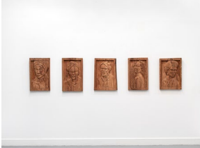
Barthélémy Toguo Bilongue Zingana wood Various dimensions