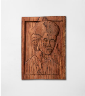
Barthélémy Toguo Bilongue 48, 2020 Zingana wood 65 x 46 cm