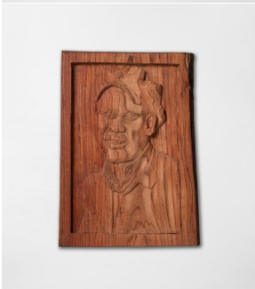
Barthélémy Toguo Bilongue 56, 2020 Zingana wood 67 x 46 cm

For press enquiries, please contact Grace Hong, 212.315.0470 or grace@galerielelong.com .