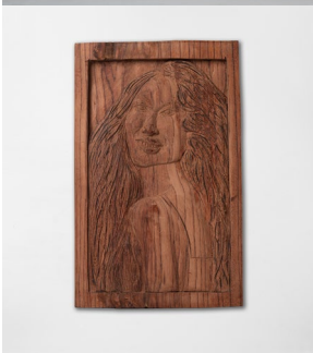
Barthélémy Toguo Bilongue 31, 2020 Zingana wood 67 x 42 cm