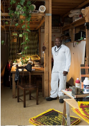
Barthélémy Toguo in his studio, 2016