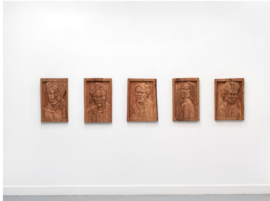
Barthélémy Togo, Bilongue 2020.

VIP Preview on June 13, 2022, 3:00pm-8:00pm